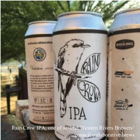
Rain Crow IPA, one of several Western Rivers Brewers' Council collaborative brews

Craft beer depends on reliable water, and so do our rivers